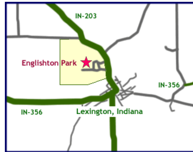
Detail Map: Lexington, Indiana

From Madison, Indiana: Take Indiana Route 56 west, thru Hanover; turn south on IN-62; Go 0.1 mile and turn right (west) on Rt 356; go approximately 7 miles to Lexington; turn right (north) on Rt 203, go 1/3 mile and turn left into Englishton Park.